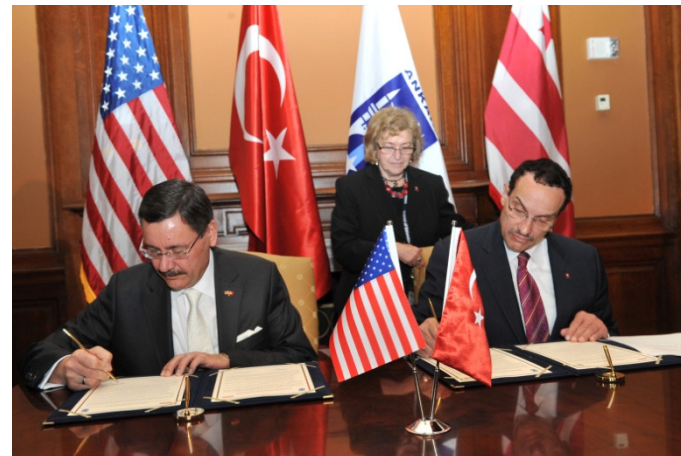
Sister City Protocol Ceremony, Washington