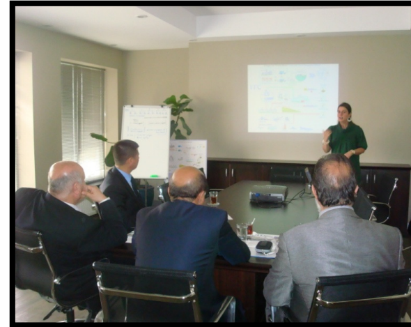
Site Visits of Kabul Municipality to Social Projects and ITC Solid Waste Management Facility