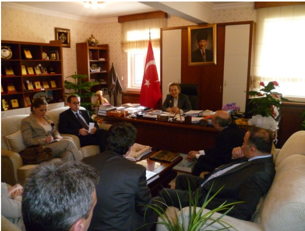
Prishtina Delegation Technical Visit