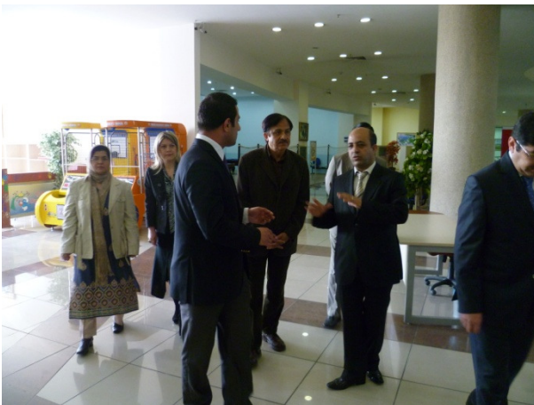
Islamabad Delegation Technical Visit