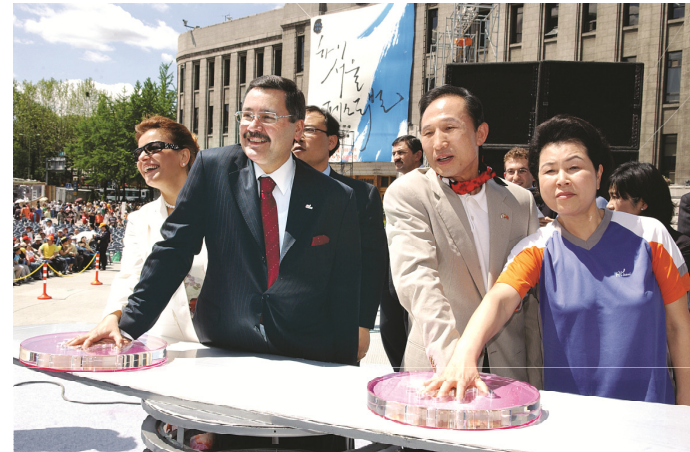
Ankara Culture Days in Seoul