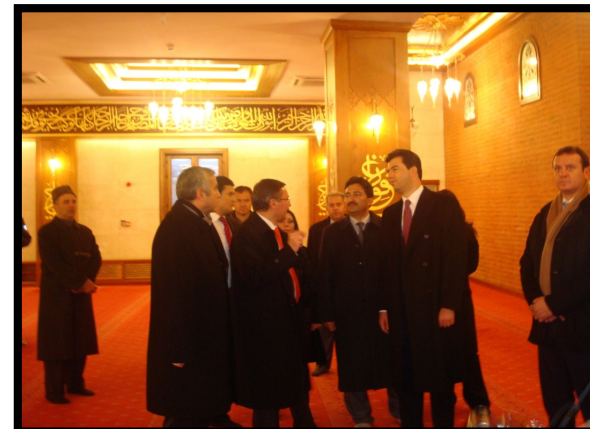
Site Visits of Tirana Municipality to Housing and Restoration Projects